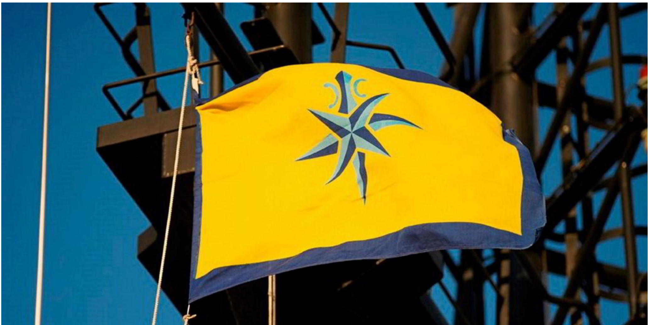
The flag of d'Amico International Shipping is seen flying on one of the Italian company's ships.