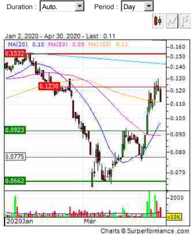
Chart D'AMICO INTERNATIONAL SHIPPING S.A.