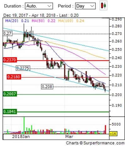
Chart D'AMICO INTERNATIONAL SHIP